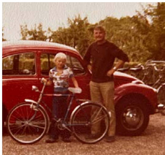
The original owner wearing the watch in front of his car. September 1977.